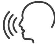
By droplets made when infected people cough, sneeze, or talk