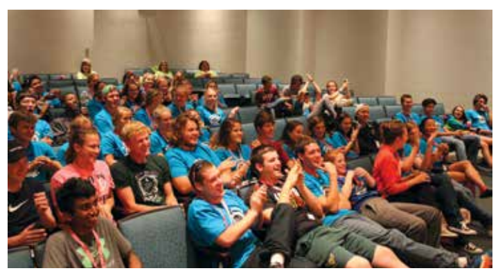
Students begin building their product on day one of Business Horizons; Students enjoy a night of improv comedy.